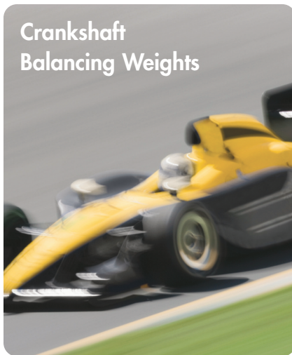
Crankshaft Balancing Weights

* N - Non-Magnetic Compositions Note: Typical Hardness for all grades is RC 32 MAX