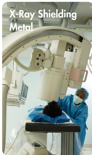
X-Ray Shielding Metal